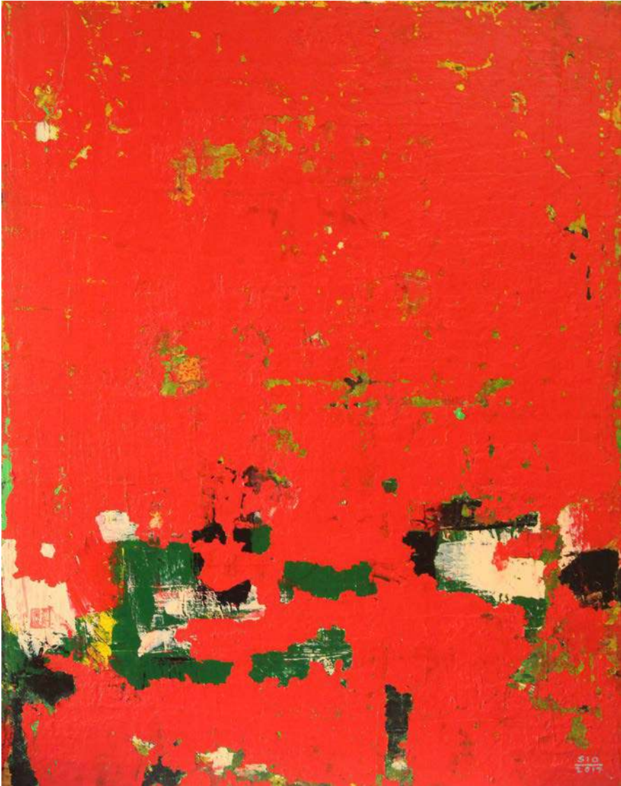
Sio Montera | New Year's Eve | 91 x 72.5 cm | Acrylic on Canvas | 2017