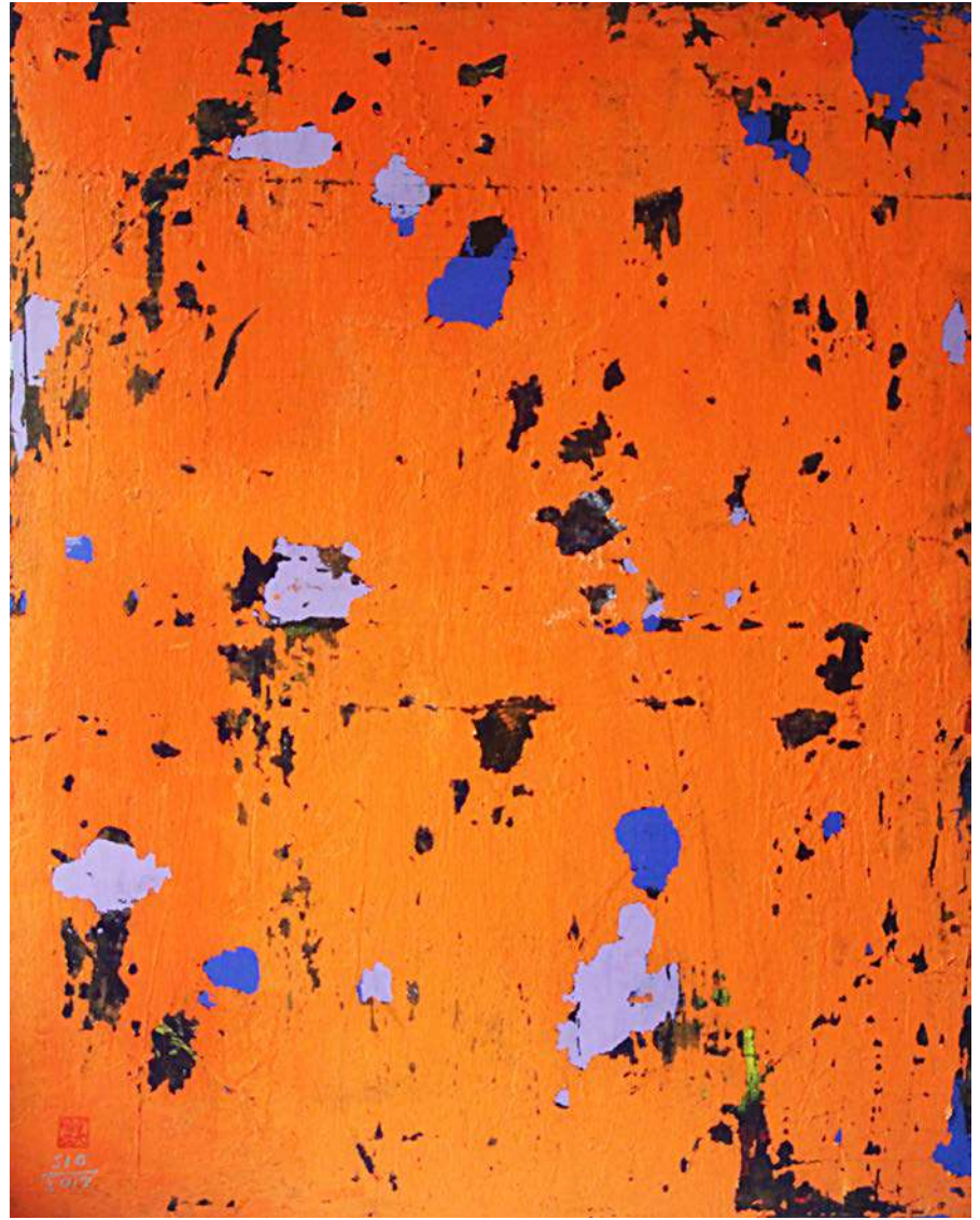
Sio Montera | A Majestic Sunrise | 91 x 72.5 cm | Acrylic on Canvas | 2017